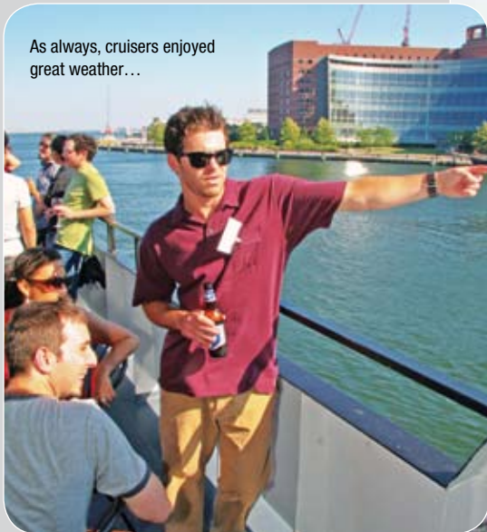
As always, cruisers enjoyed great weather...