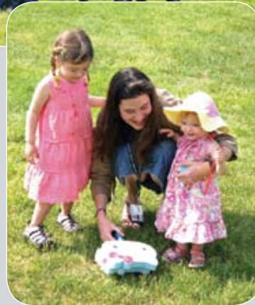
Fun in the sun for families, dogs, and Straw Dogs.